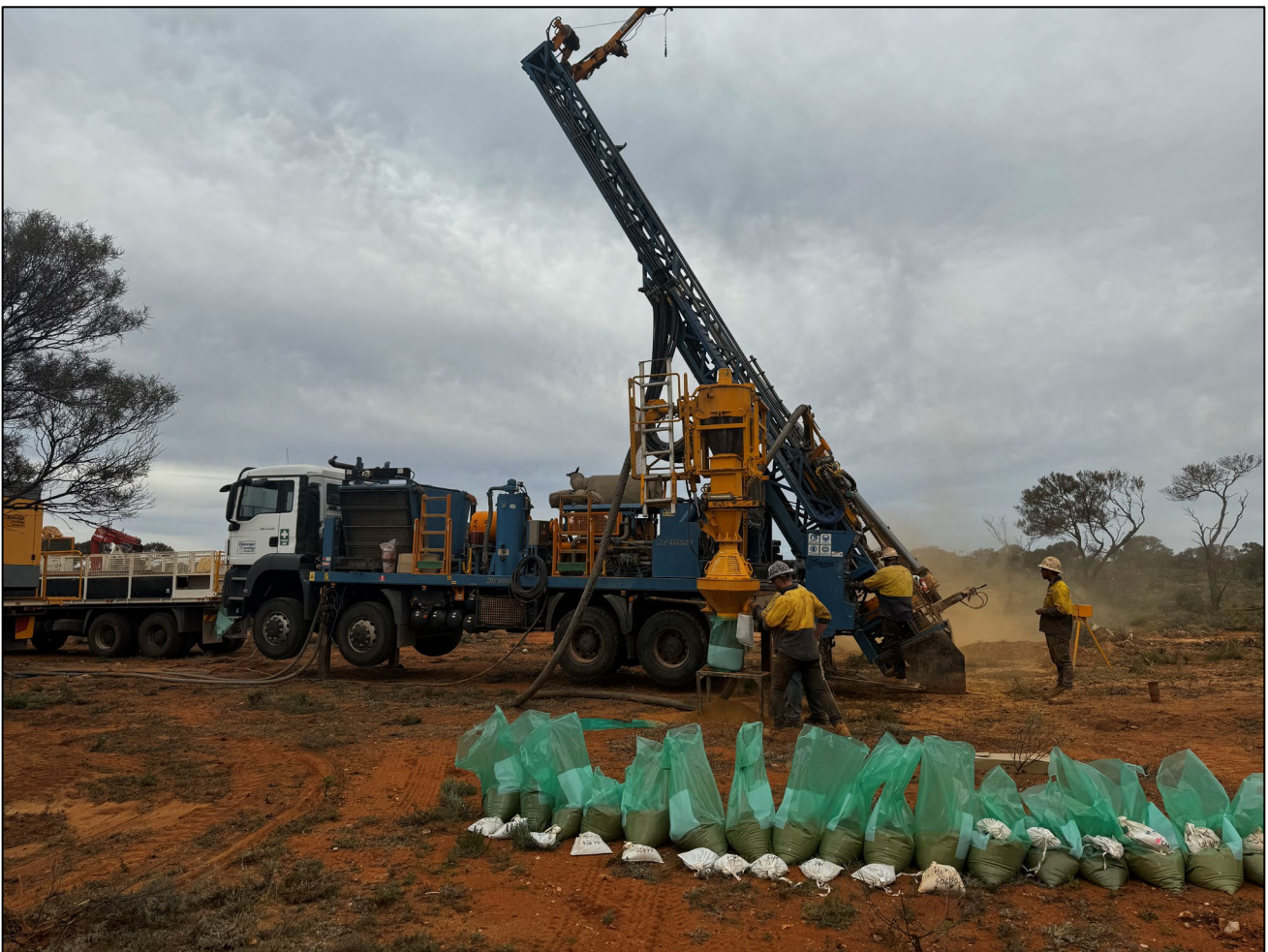
Figure 1. Challenge Drilling on site at Landed at Last, Yundamindra Gold Project.

The drill rig has commenced on the northern most planned Landed at Last RC holes and is steadily making its way south (Figure 1). Samples will be collected and sent to Intertek Analysis Laboratories to rapid turnaround of results.