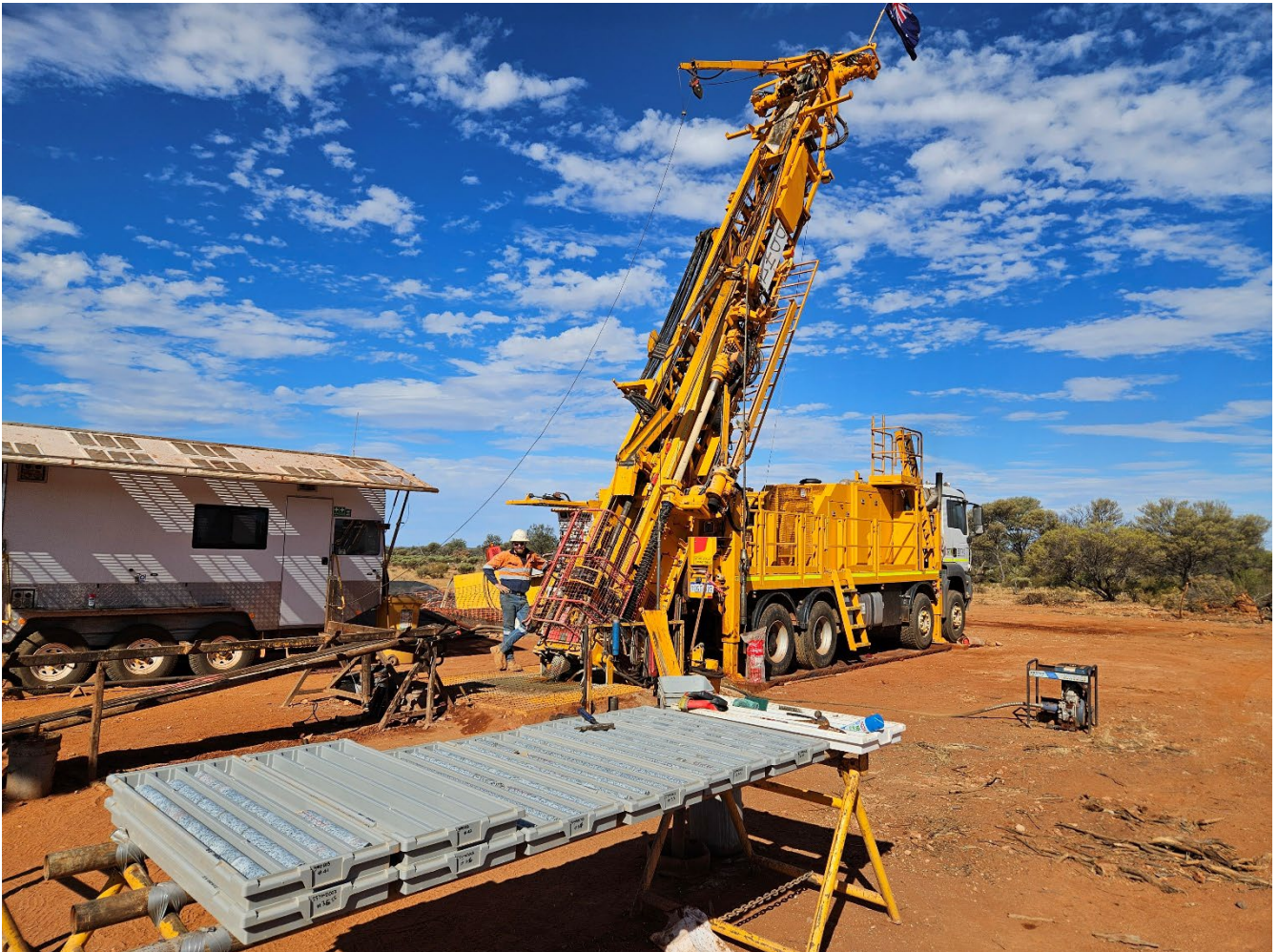
Photo 1 : DDH1 Diamond Drill Rig in operation at Yundamindra Gold Project.

We eagerly await the assays form the recent RC program, which are due shortly, and look forward to delivering strong news flow from this exciting project.”